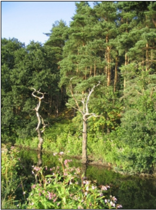
The wooded hills by the Maun

the road round to the right on to Squires Lane. As you go down the hill the ruins of palace can be seen just above the houses. Squires Lane with views of the palace ruins. About half way down the lane are Old Barn Cottages, these were probably converted from the barn and may contain parts that date back to 1730 when Clipstone Hall occupied the site next door.