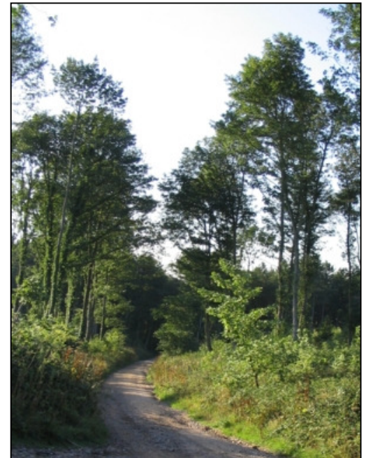
The hill at site 8

10. The track runs almost straight past Cavendish Lodge. Follow